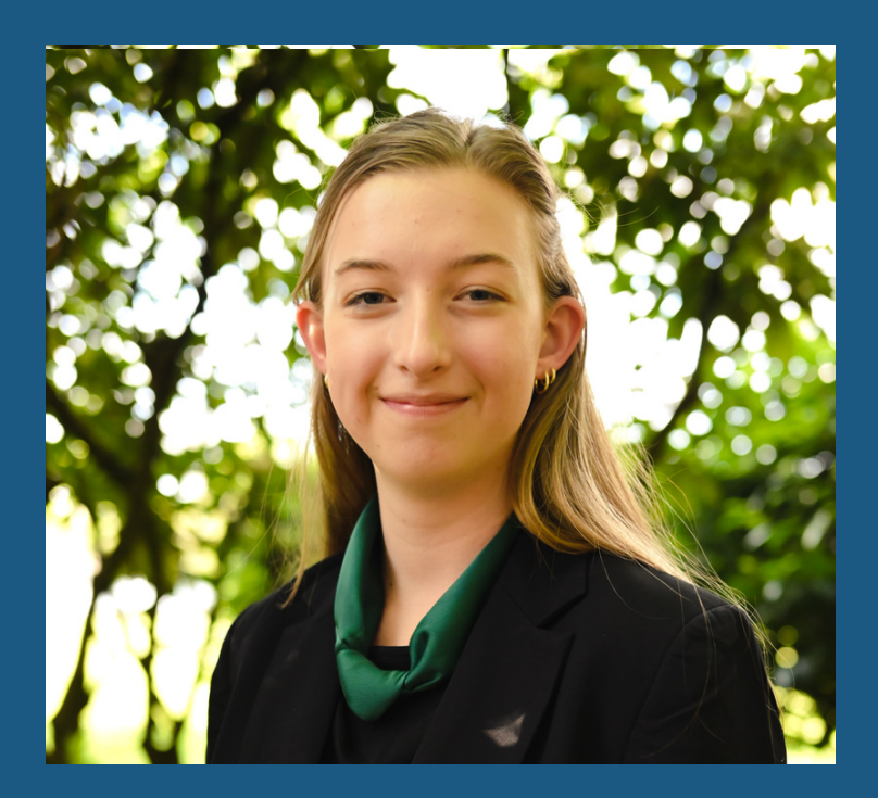
NORTH CENTRAL REGION VP EASTMONT HS