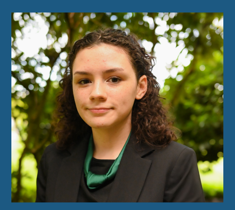
SOUTHEAST REGION VP WALLA WALLA HS